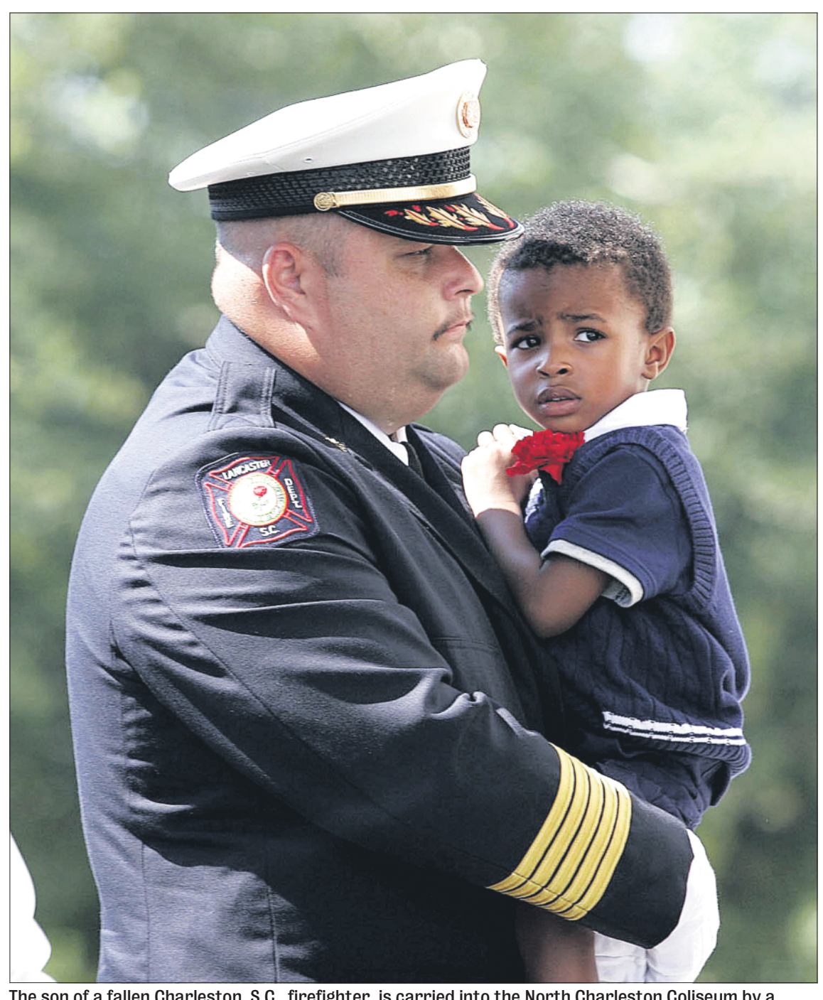
The son of a fallen Charleston, S.C., firefighter, is carried into the North Charleston Coliseum by a Lancaster firefighter Friday in North Charleston, S.C.